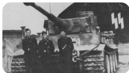
Tiger II Mg 34 German Soldiers >