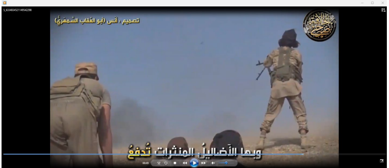
Upper Left Text: Designed by: Anas (Abu-al-‘Uqab al-Samhari) Upper Right Emblem: Sarh al-Khilafah And by it all misguided delusions are destroyed.