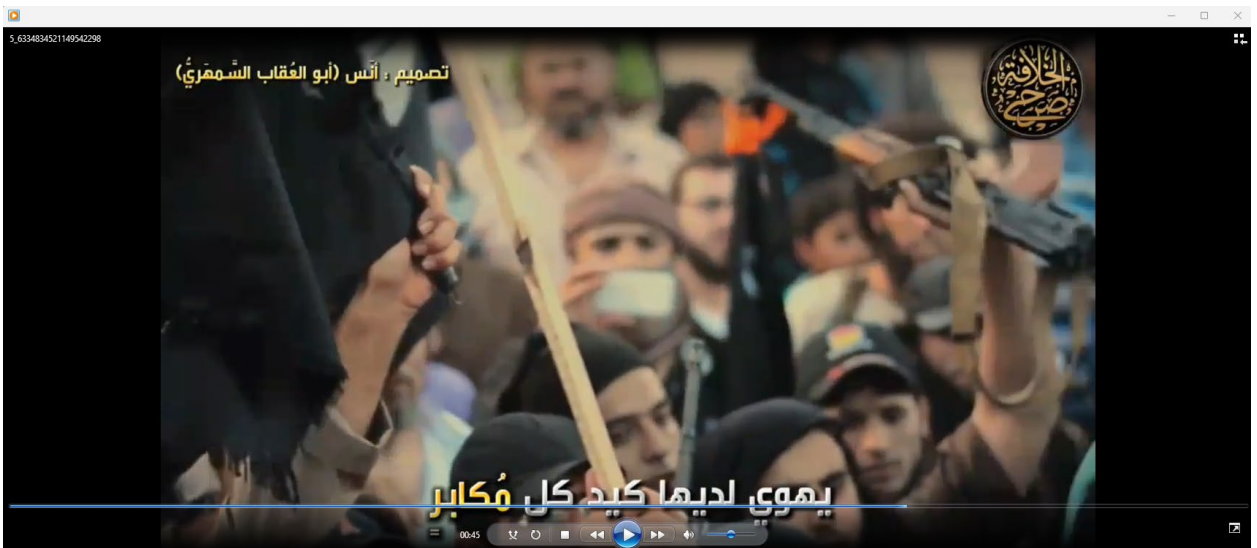
Upper Left Text: Designed by: Anas (Abu-al-'Uqab al-Samhari) Upper Right Emblem: Sarh al-Khilafah Under it every deceitful act of the arrogant dies.