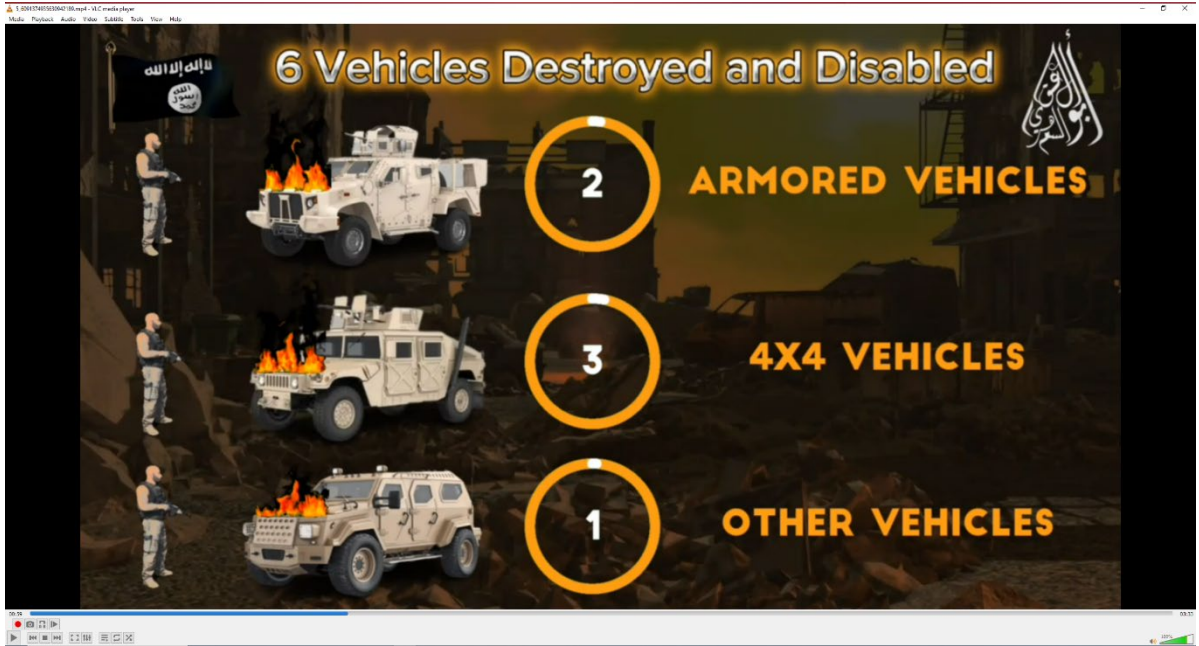
Left upper corner: ISIS Flag Right upper corner: "Abu al-'Uqab al-Samhari" (the Defendant's kunya)