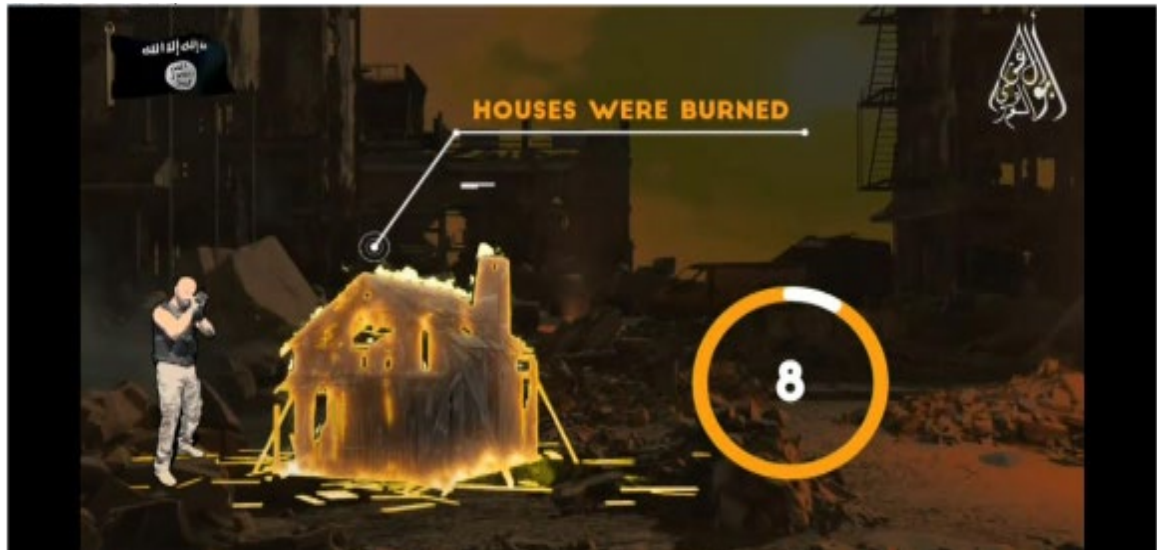
Left upper corner: ISIS Flag Right upper corner: "Abu al-'Uqab al-Samhari" (the Defendant's kunya)

On or about January 6, 2024, the Defendant sent the Designer a message and a jpg picture file explaining that the Defendant had created the design in the file, although the FBI has not yet located this file on the Defendant's devices. On or about January 7, 2024, the Designer replied