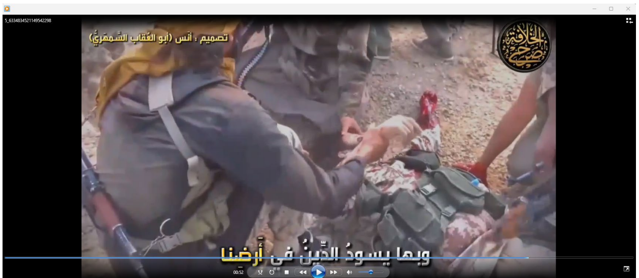
Upper Left Text: Designed by: Anas (Abu-al-‘Uqab al-Samhari) Upper Right Emblem: Sarh al-Khilafah And through it, faith will spread throughout our land.

On or about December 31, 2023, the Defendant sent the Designer another mp4 video file the Defendant created celebrating death and destruction caused by ISIS. Screenshots from this video are below, along with captions that include the FBI’s preliminary translations in brackets: