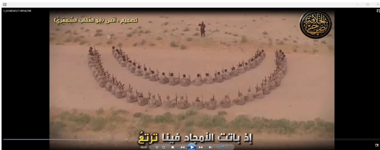
Upper Left Text: Designed by: Anas (Abu-al-‘Uqab al-Samhari) Upper Right Emblem: Sarh al-Khilafah “Glory in us is brewing”