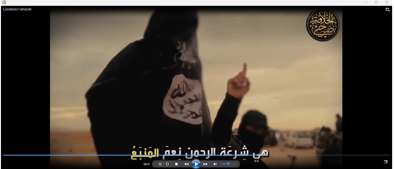
Upper Right Emblem: Sarh al-Khilafah It is the law of the Merciful One...the best source.